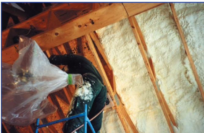
Icynene is sprayed directly on to the roof deck. There are no air vent channels.

The electricity consumption would have been reduced further if the fiberglass had been removed from the remaining portions of the attic and walls. The homeowner was aware of the potential added benefit of completing the project but did not want to be involved in further renovations.