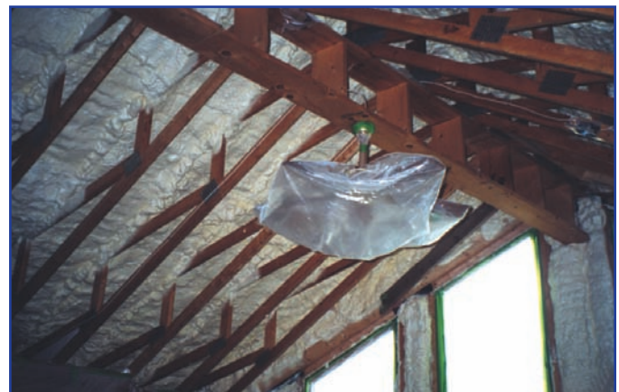
Icynene is sprayed to a depth of 5 1/2 inches and adheres directly to the roof deck.