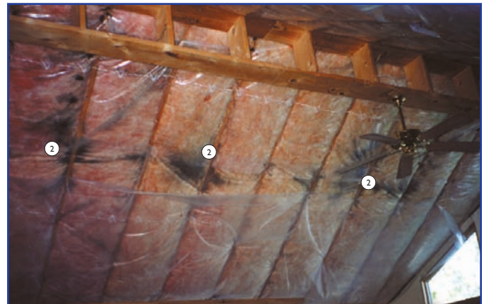
(2) Hot humid interior air had leaked past the poly, through the batt insulation, and come into contact with the cold air in the venting, thus causing condensation and mold.