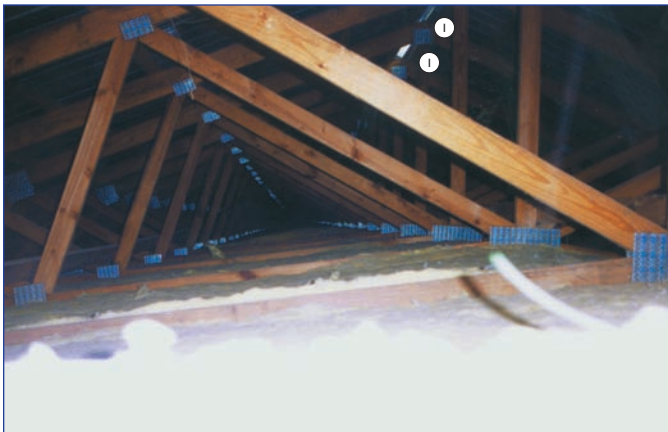
(1) Cracks in the ridge vents allow air leakage into the poultry house.

The University of Georgia’s College of Agricultural and Environmental Sciences conducted a study on a broiler farm to demonstrate the effects of air sealing and improved house tightness. The study was conducted on a farm with two 40’ x 400’ broiler houses. The amount of air leakage was estimated by conducting a static pressure test. The side wall and tunnel inlets were closed, then one 48” fan was turned on and the static pressure was measured. The static pressure created by the one 48” fan was found to be approximately 0.03” in both houses (as measured by the vent opening), indicating that there was well over 20 square feet of leakage in each house.