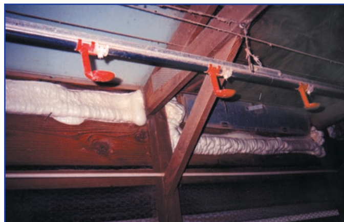
Sealing of the side wall gaps/cracks with Icynene to prevent air leakage.