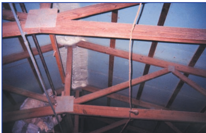
Sealing of the ridge vent with Icynene insulation to prevent air leakage.